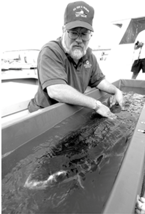
A veterinarian gives the shark a checkup before her trip to the aquarium.

were sometimes caught this way. The aquarium had a special floating pen waiting in coastal waters nearby. While the shark lived in the pen, she was fed the same things she would have eaten in the wild—smaller sharks and other fish. The floating pen helped her get used to living in a small space.